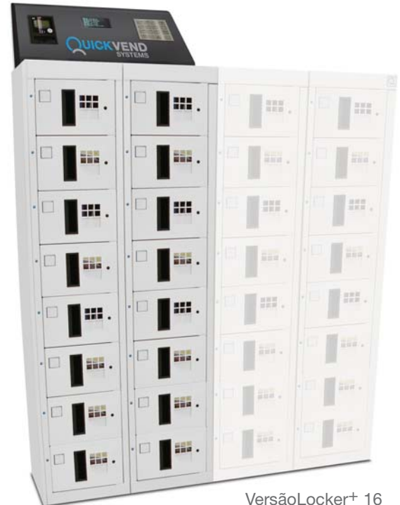
VersãoLocker+ 16 (with 24 and 32 door options)

Total control of your critical calibrated equipment, from just £25 a week